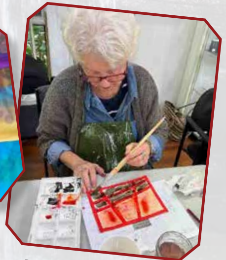
Developing the final design