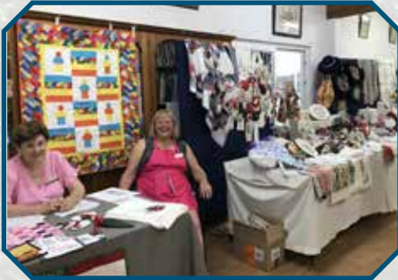
Glens and May happily mining the Needlework & machine embroidery stall