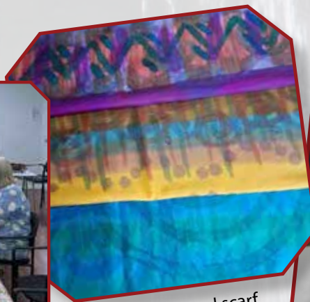
Beautiful painted scarf by Roxanne