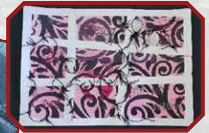
completed design by Annette