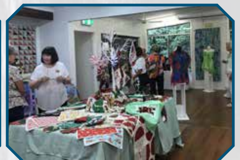
Patchwork & Fibre Arts have opened up their display space