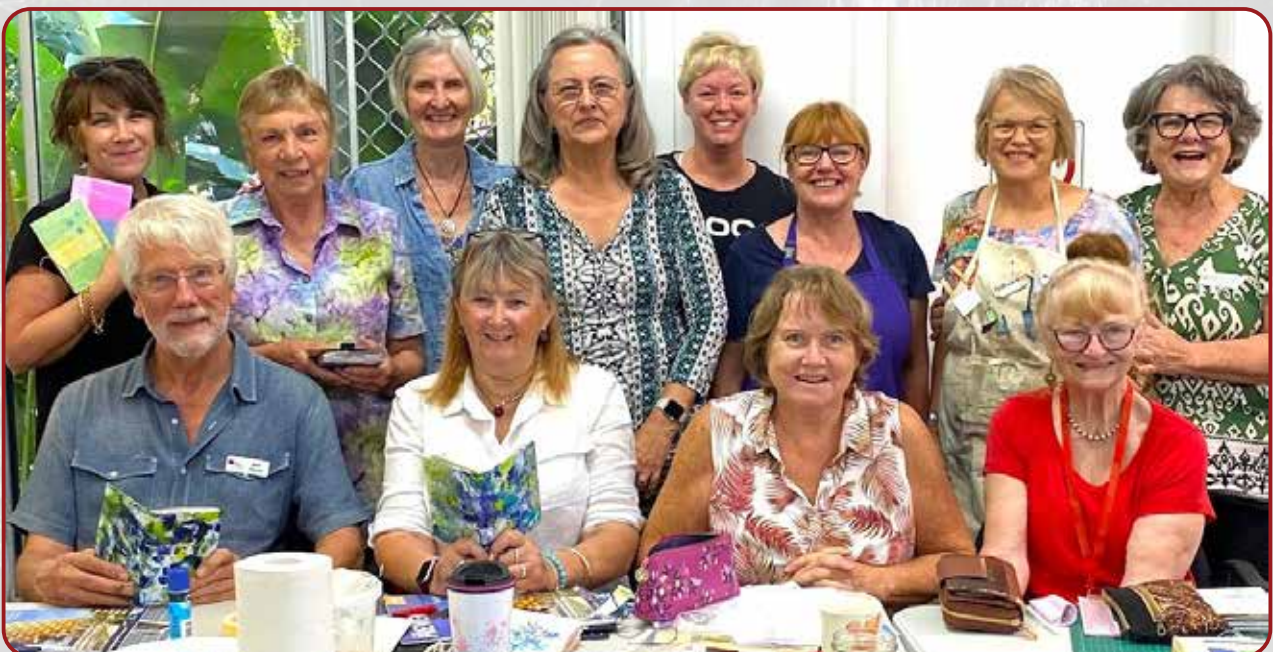
The happy group