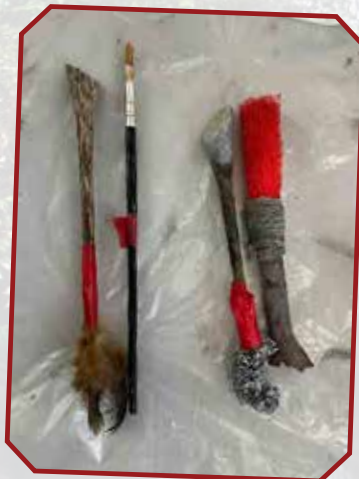
tools for working on design