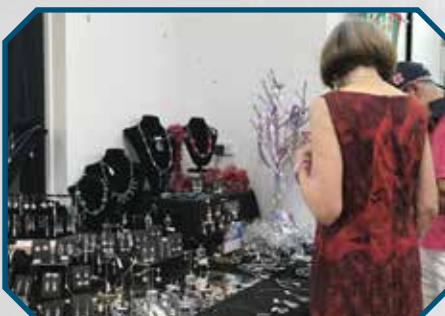
Silversmiths pandora of delights!